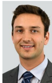
Tommy Bush Asset Management San Francisco